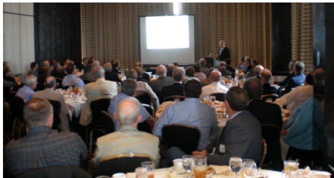
Turn out was so large; the buffet gave way to a sit-down lunch

Multiples of cash flow for ORRI and royalties greatly exceed the monthly cash flow multiple for working