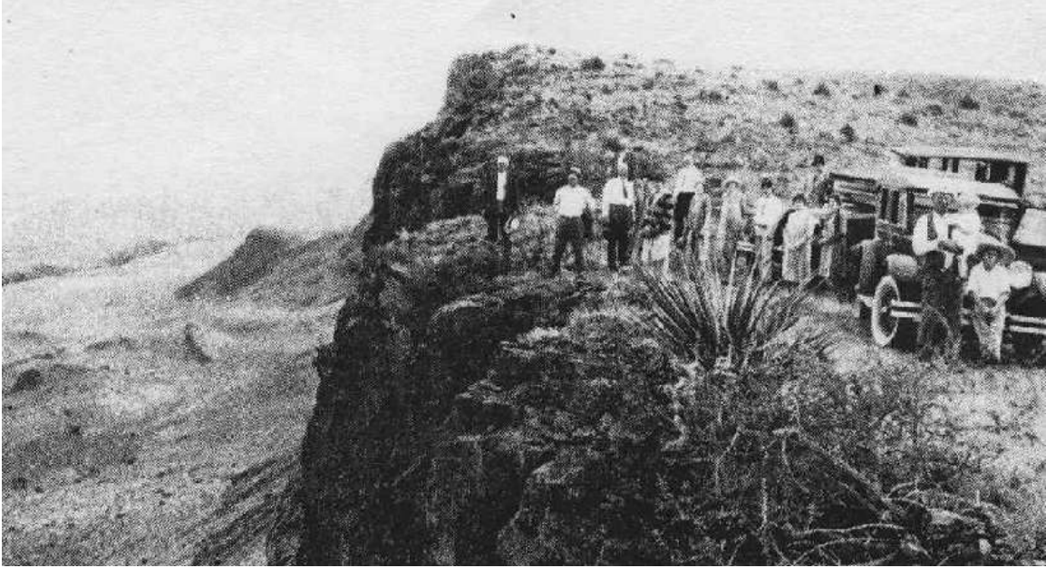
Family Members at “The Rim”

After my grandfather left the Ranger force, he managed a ranch at Chispa, which is now a part of the Brite family spread. In the original Ranger diary, written in Spenserian Handscript, there were also a number of very old faded photos of him exploring the streams and canyons of the area and of him on horseback at the ranch. He had later married my grandmother in El Paso but continued to live in the Marfa area and my mother was born in the Brite home there. Retiring from ranching, he purchased a general store and lumber yard in Sierra Blanca and raised his family there for a time prior to his death.