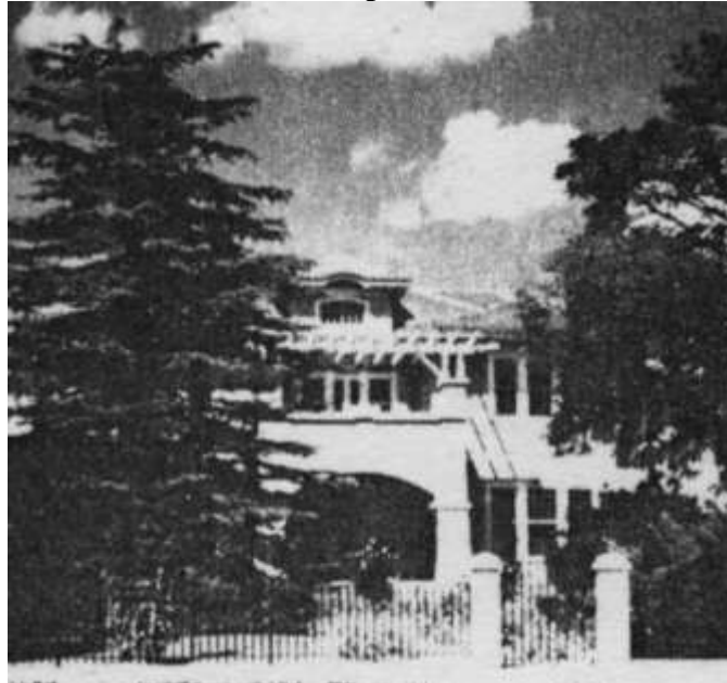
Brite Home in Marfa