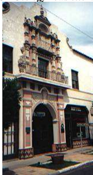
Paisano Hotel Front

Long before my fascination of the area was cultivated, I had only briefly traveled through this part of West Texas in my youth. While taking a University of Texas Geology field trip in the area our scruffy group of students rolled into Marfa while the epic picture Giant was being made. We had arrived in a conventional old yeller school bus with the word “Hell” pasted into the front destination window and a rattlesnake adorned slop jar attached to the front of the hood. Greeting us was a large banner hanging over Marfa’s main street proclaiming, “Marfa is Proud of George Stevens Giant” (After the movie was shown, however, the banner was not seen again). Our grossly adorned geology bus found no space to park in front of the old El Paisano Hotel so an unnamed devilish group of students “rescued” the large Texas shaped sign in front on which was written (“No Parking, Reserved for Giant Prods.) which was then later held hostage within the confines of old yeller. It was noted that here was no room on the sign for the whole word “Producers”. Photos of this parking sign and the bus with the criminals perched alongside were prominently published in the UT Geology newsletter several years later.