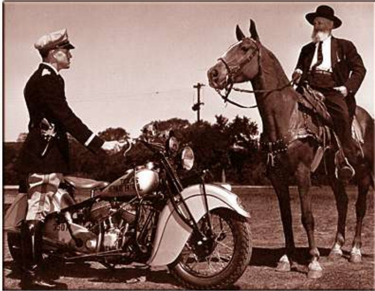
Texas Ranger John R Hughes